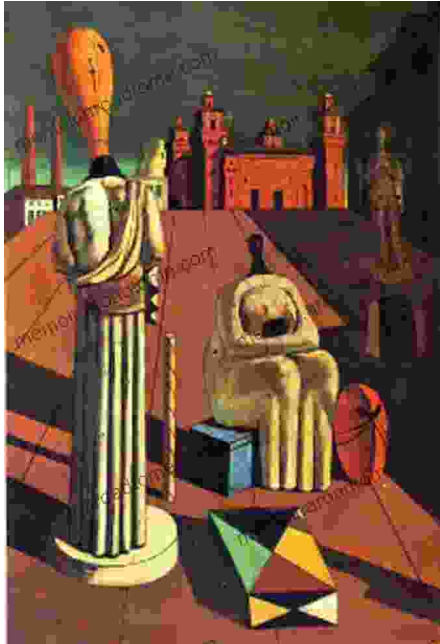
Giorgio de Chirico, The Disquieting Muses , 1918

De Chirico's paintings offer a profound exploration of the inner landscape of the human mind. His enigmatic scenes evoke a sense of solitude, introspection, and contemplation, inviting the viewer to delve into their own subconscious thoughts and emotions.