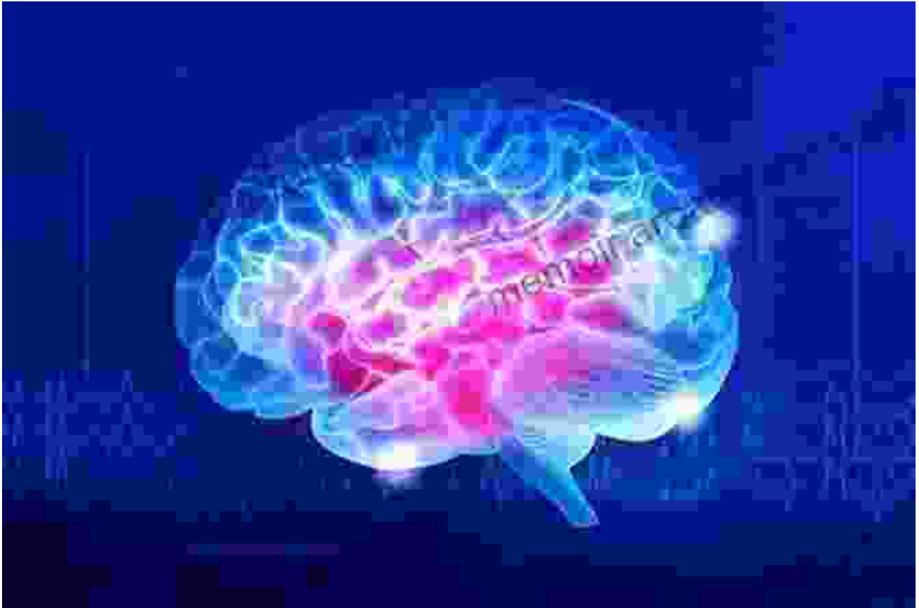
Image: Social neuroscience brain scan

Witness the groundbreaking advancements in social neuroscience. This volume investigates the neural mechanisms underlying social cognition, empathy, and prosocial behavior. It reveals how brain imaging techniques shed new light on the intricate workings of the human mind in social contexts.