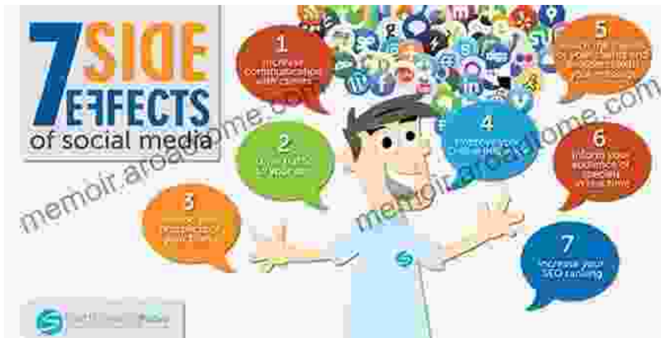
The Multifaceted Impact of Social Media on Society