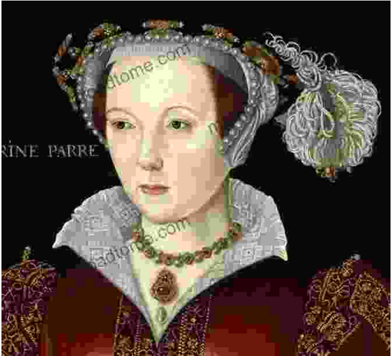
Catherine Parr translating the Bible