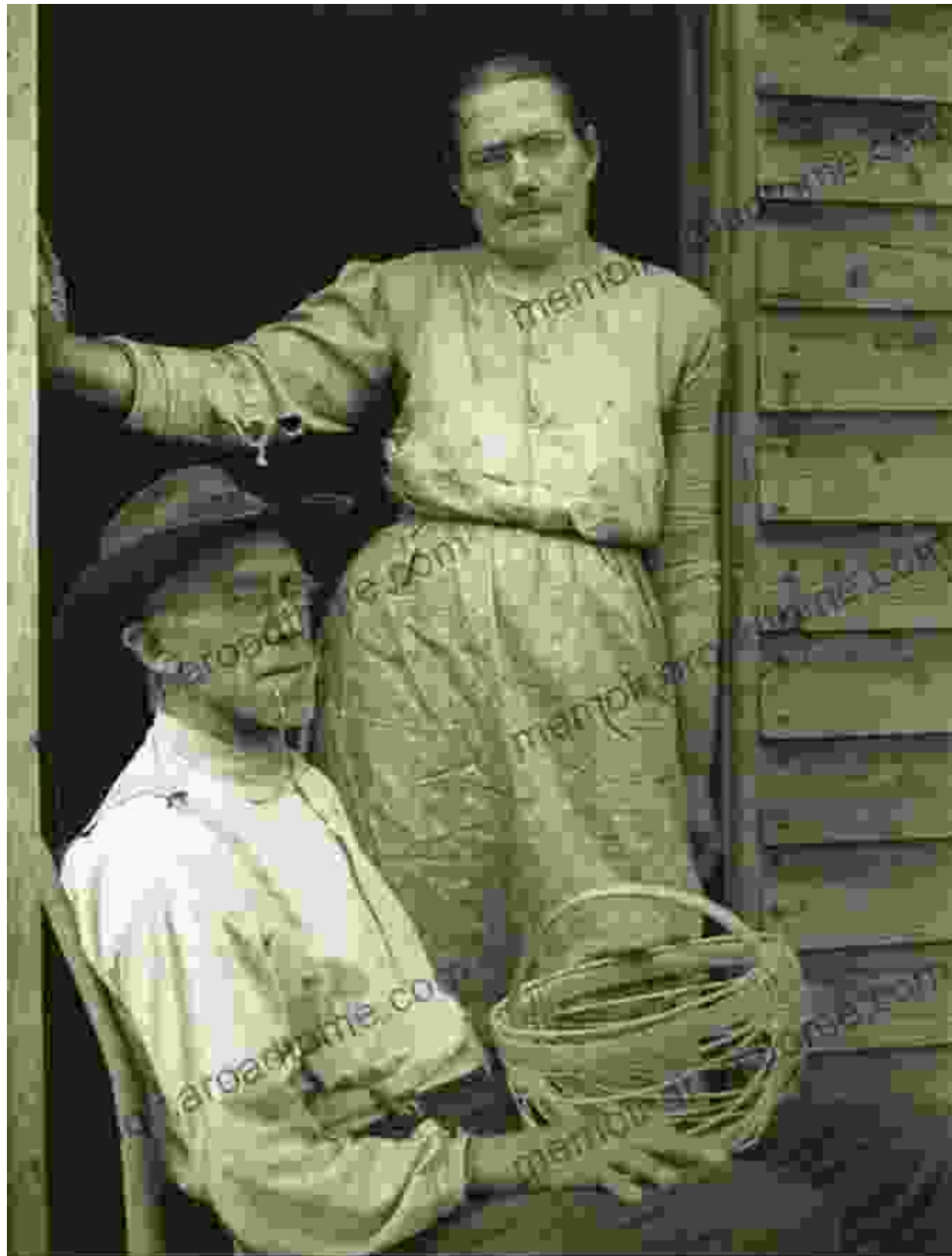
Preserving a Cultural Legacy

Ulmann's portraits captured the nuances of human emotion, revealing the joy, sorrow, determination, and wisdom etched on the faces of her subjects. Her images conveyed a profound respect for their traditions, their struggles, and their indomitable will to survive.